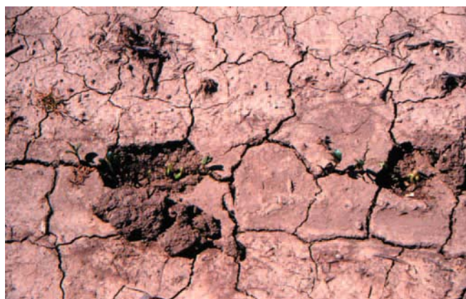
Figure 1. Inhibition of soybean seedling emergence by severe surface crusting.

The objectives of this fact sheet are to review possible sources of gypsum for agricultural use in Ohio, and to report results from chemical and mineral analyses of representative samples.