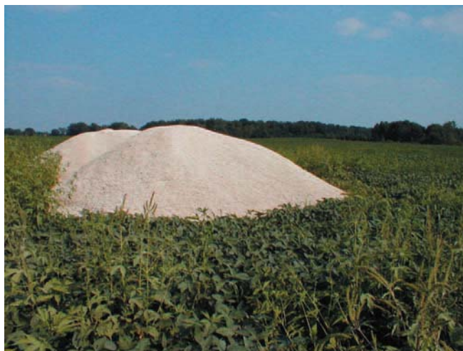
Figure 3. Gypsum stockpiled in the field for post-harvest application.

The cost and ease of land application are heavily dependent on factors such as water content, particle size, and purity of the gypsum product. The samples collected for this study included products taken directly from the sources as well as materials stockpiled in the field in preparation for land application (Figure 3). As a result, the water contents varied considerably (Table 2). Water content was consistently small ( < 1\% ) for the mined gypsum and the recycled cast material, neither of which were exposed to rainfall. Water contents of the synthetic FGD-gypsum were below 10%, even though the manufacturer reports that the product has an average water content of 12%. Drywall gypsum contained 1% water at the recycling facility, whereas contents were as high as 19% after storage in the field.